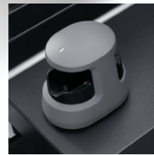
Biometric Authentication, HID Proximity Cards, and other powerful options guard your bizhub from unauthorized use.

HDD Lock applies password protection to your bizhub 250 GB hard disk drive. The Job Erase function automatically overwrites your HDD up to three times every time a job is performed. When you move your bizhub device to another location, HDD Sanitizing can overwrite data in eight different modes so sensitive information will not be compromised. These comprehensive overwrite methods meet United States DoD, NSA and other international standards.