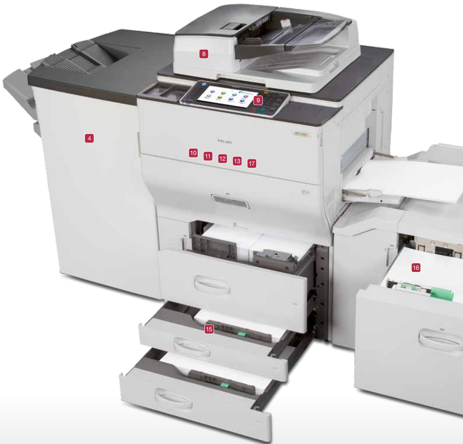
Ricoh MP C6502/MP C8002