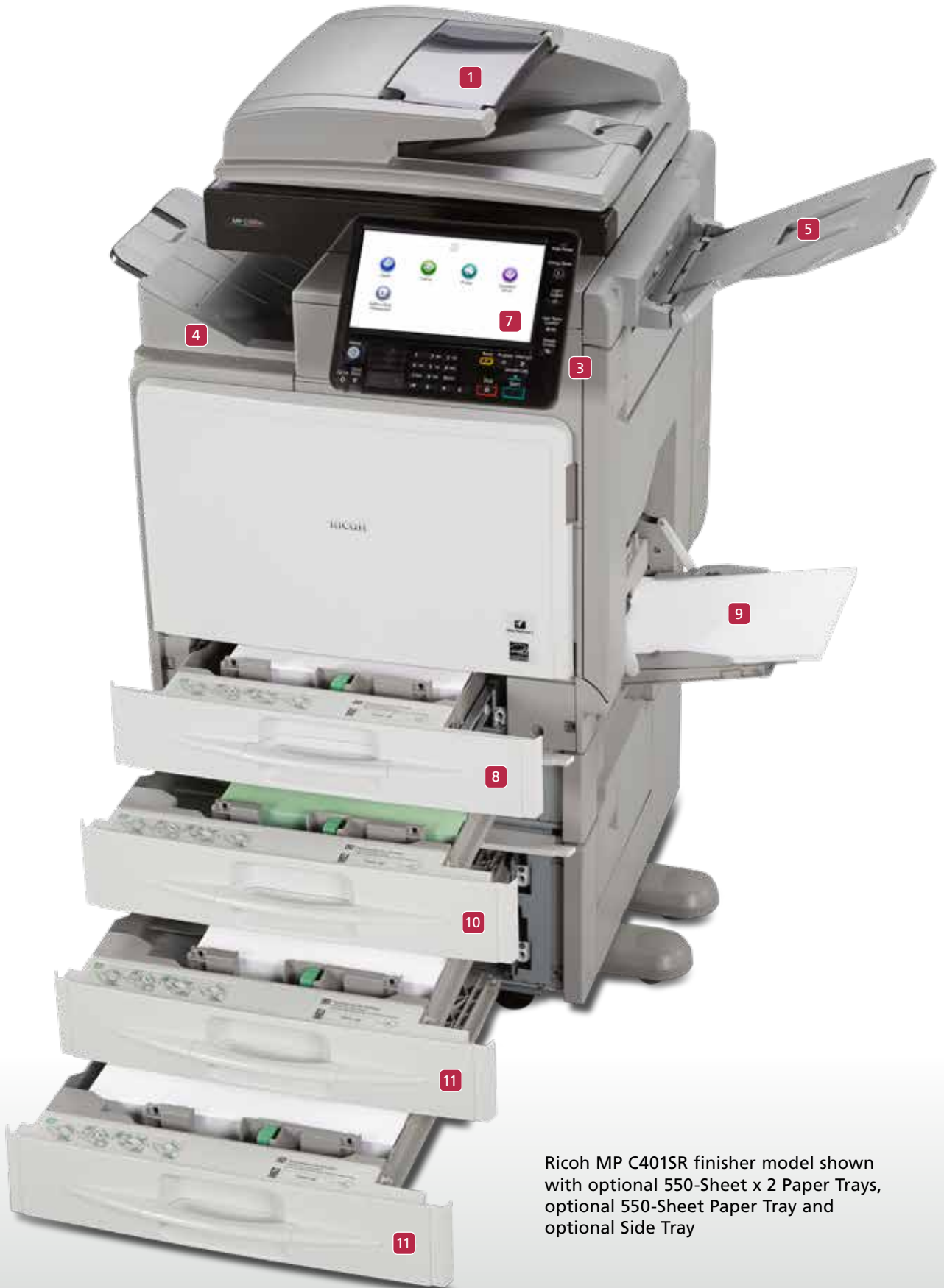
Ricoh MP C401SR finisher model shown with optional 550-Sheet x 2 Paper Trays, optional 550-Sheet Paper Tray and optional Side Tray