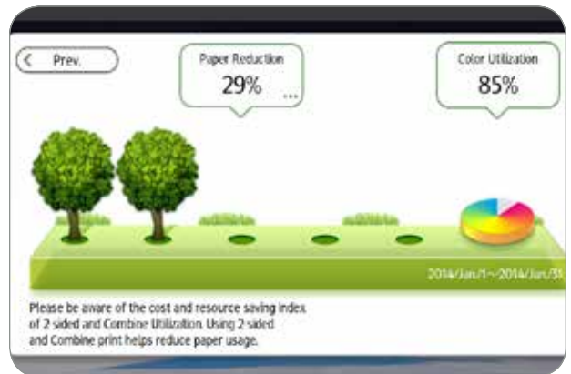
Eco-Friendly Indicator Screen as shown on Smart Operation Panel.

We strive to be stewards for the environment. That's why we give you more ways to take responsibility for your own energy and paper use. The Ricoh MP C401/MP C401SR offers expanded energy-saving modes to reduce power consumption. Program it to shut down or power up automatically to conserve energy during expected downtimes. Take advantage of standard duplexing to reduce paper and associated costs. Set print quotas for individual users or groups to reduce unnecessary printing. And, use the built-in Eco-Friendly Indicator to see how much paper your team is saving. These models meet the new stringent standards for ENERGY STAR™ 2.0 certification and have qualified for an EPEAT® gold rating.