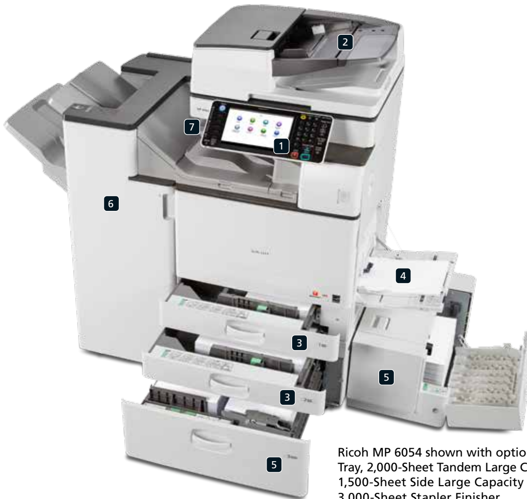
Ricoh MP 6054 shown with optional One-Bin Tray, 2,000-Sheet Tandem Large Capacity Tray, 1,500-Sheet Side Large Capacity Tray and 3,000-Sheet Stapler Finisher.