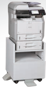
Standard Tray with one 500 Sheet Tray