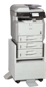
Standard Tray with one 250 and one 500 Sheet Tray