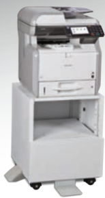
Standard 500 Sheet Tray