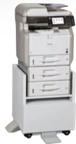
Standard Tray with two 500 Sheet Trays