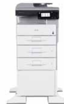
MP 301SPF with Two Optional PB1040 Paper Trays and FAC 58 Cabinet