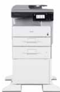
MP 301SPF with Optional PB1040 Paper Tray and FAC 58 Cabinet