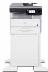
MP 301SPF and FAC 57 Cabinet

Some features may require additional options.