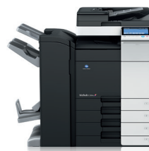
Mid-Volume Color bizhub C554e bizhub C454e bizhub C364e bizhub C284e bizhub C224e