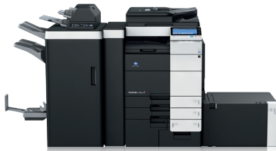
High-Volume Color bizhub C754e bizhub C654e

Innovation. With Konica Minolta, you'll have innovative MFP solutions that give shape to ideas. Every Konica Minolta Office MFP and desktop printer/copier benefits from a design philosophy that puts more power in less space, with simple control and plug-and-play integration of software solutions. You'll have a wide range of choices in color and B&W, all with high-tech features and workhorse reliability – qualities that make Konica Minolta today's first choice in office productivity.