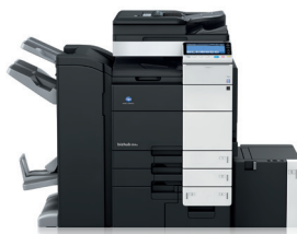
High-Volume B&W bizhub 754e bizhub 654e